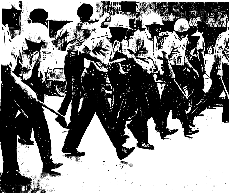
City policeman duck as bottles and stones are thrown at them during their advance to quiet crowd. Two policemen, a fireman, and several other persons were injured during the melee which lasted into the early morning hours.