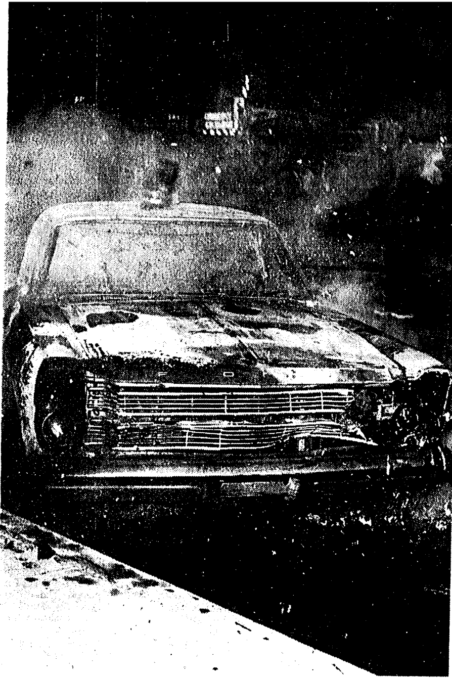
One of three squad cars burned by crowd, largely Puerto Rican, in disturbance last night at Division street and Damen avenue. A fire hose was ripped from firemen who sought to extinguish blaze. (Story on page 1)