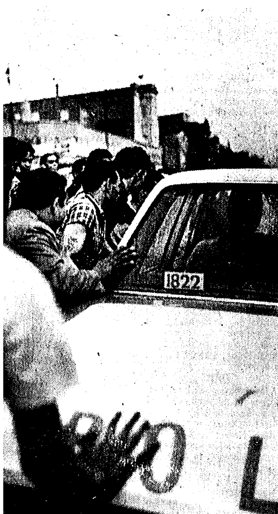
Another squad car is pushed by crowd in apparent effort to tip it over as police try to drive it away the tires are flat.

action was marked by almost continuous fighting between policemen and Puerto Rican youths. Many merchants locked their stores, some of which were looted early today.